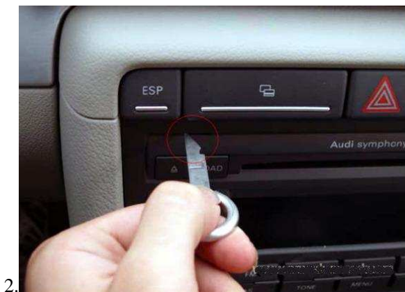
Use Special key to dismantle