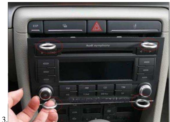
Put 4 keys, insert the key hole together and then pull out the original screen.