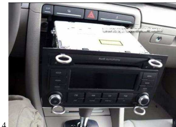
See below after take down the original device.